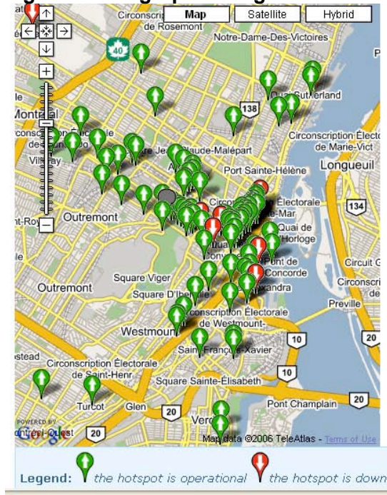
Figure 4: Geographic range of the network

To date, Île Sans Fil has implemented over 140 free hotspots and has registered over 45,000 users. 27 Figure 4 illustrates the geographic range of Île Sans Fil's network with each arrow represents one hotspot. ISF hotspots spread north-east from the intersection of highway 15 & 20 and south-west from the intersection of highways 40 & 25 towards the St. Lawrence River.